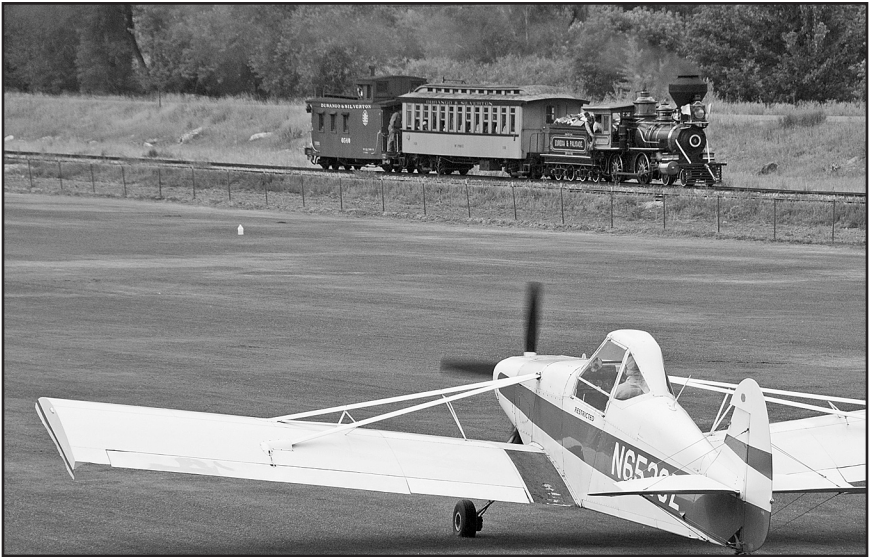
Eureka #4 rolled north past the Durango Soaring Club, Inc., located at Val-Air Gliderport, three miles north of Durango, Colorado, on August 13, 2009. The plane in the foreground is a tow plane for gliders.