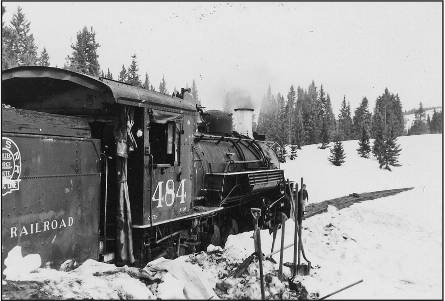
484 was derailed just east of Windy Point on May 13, 1973, while attempting to open the line for the 1973 season.