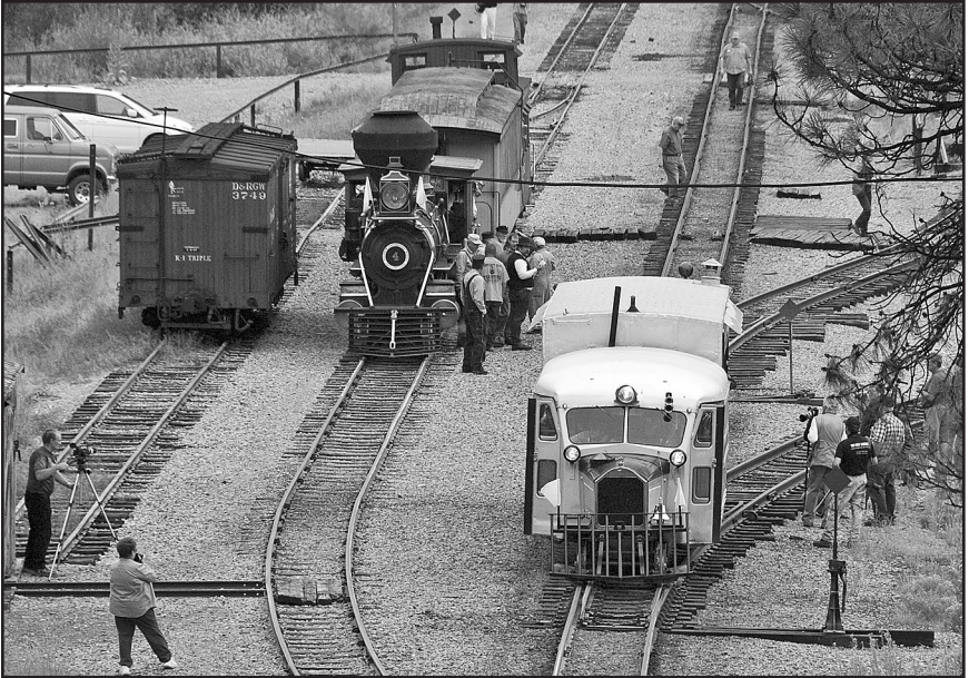
Galloping Goose #5 was running along with Eureka & Palisade #4 at Railfest 2009. The Goose was on the Rockwood Wye switch heading north on August 13, 2009.