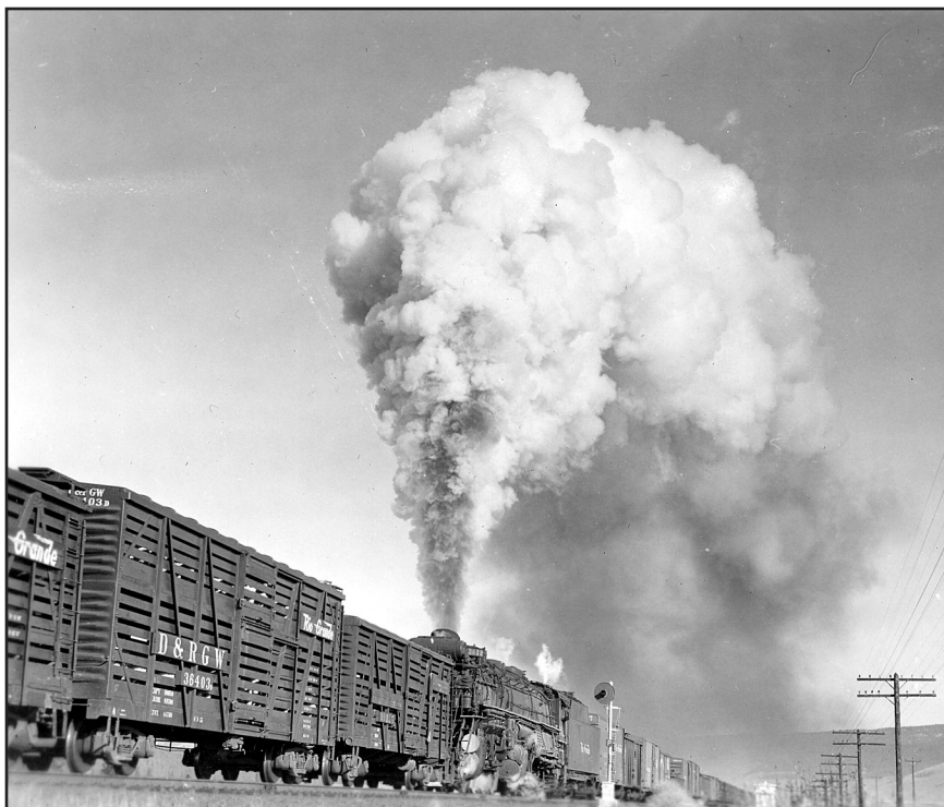
Helper engine D&RGW 3612 passing Frasier, Colorado, on October 7, 1956.