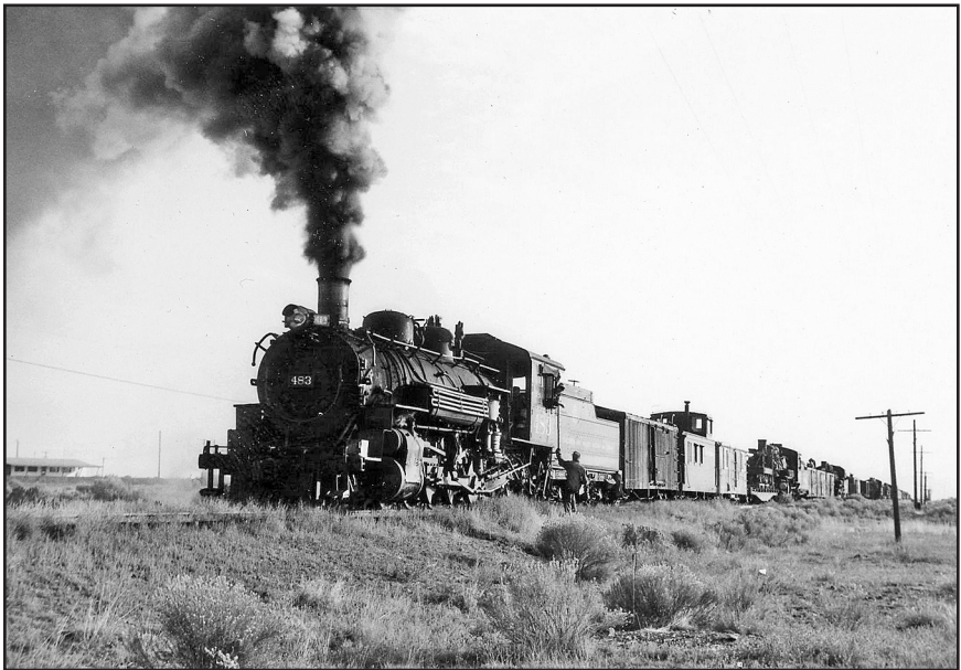
483 and 482 at Antonito along with miscellaneous equipment that will be moved to various sidings west of Antonito on September 19, 1970.